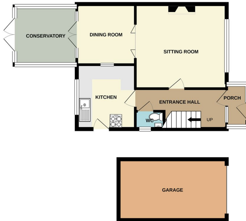
TOTAL FLOOR AREA : 1055 sq.ft. (98.0 sq.m.) approx.

Whilst every attempt has been made to ensure the accuracy of the floorplan contained here, measurements of doors, windows, rooms and any other items are approximate and no responsibility is taken for any error, omission or mis-statement. This plan is for illustrative purposes only and should be used as such by any prospective purchaser. The services, systems and appliances shown have not been tested and no guarantee as to their operability or efficiency can be given. Made with Metropix ©2021